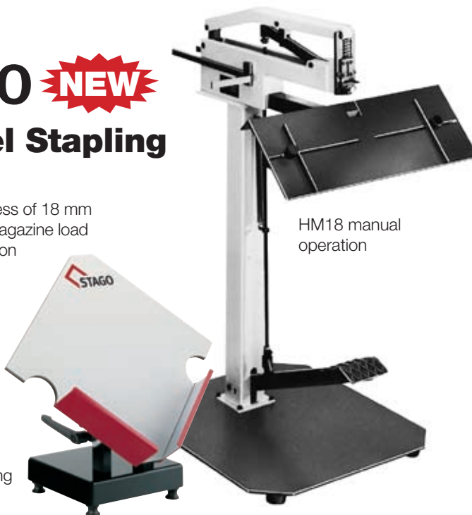
HM18 manual operation

A. E. HUDSON PTY. LIMITED • www.hudsons.com.au