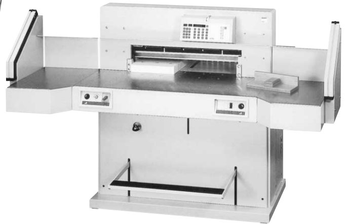
Model 721Lt 720 mm Cut