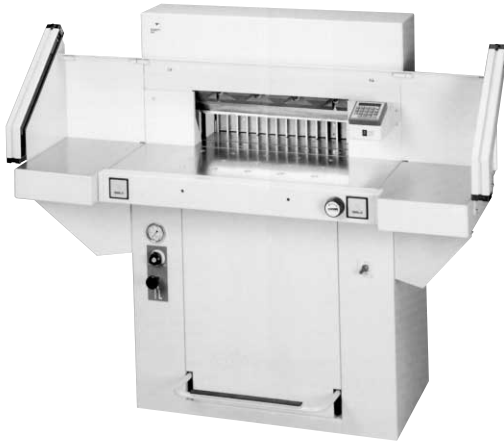
Model 551LT 550 mm Cut