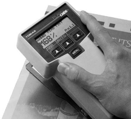
PLATE-CHEK DENSITOMETER for CTP & CONVENTIONAL PLATES

"Creative by Design — Proven by Performance"