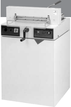
Model 430E Electric