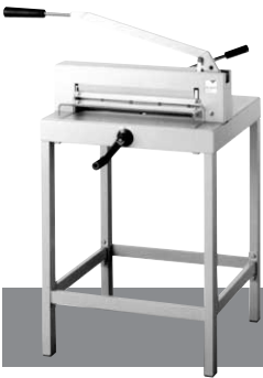
Model 430 Manual