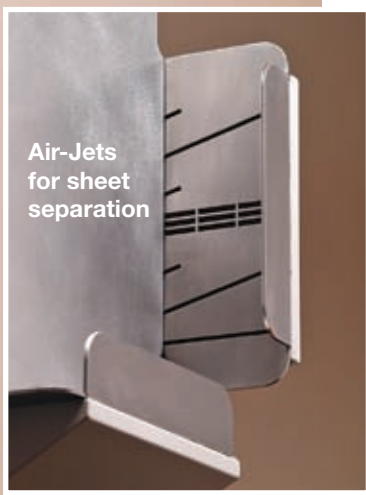
Air-Jets for sheet separation