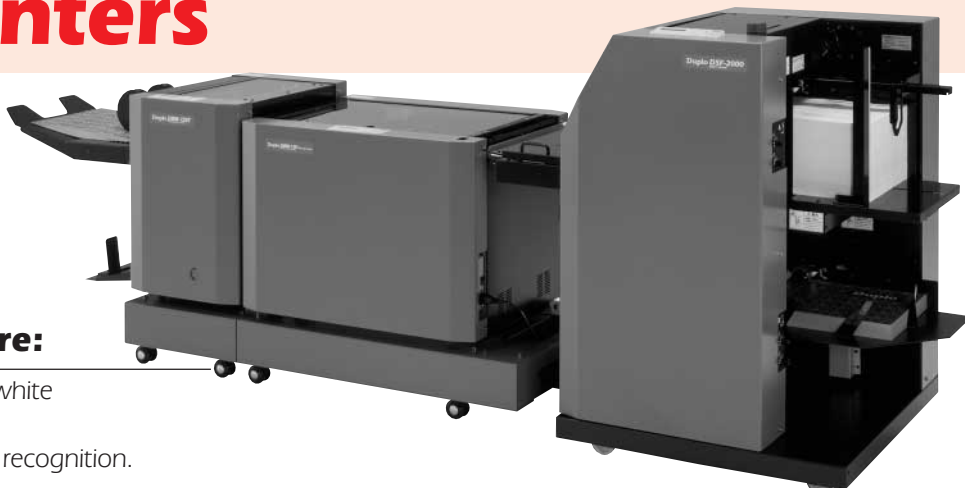
DSF-2000 Document Sheet Feeder DBM-120SxS Bookletmaker DBM-120T Trimmer

Digital Printing Isn't Finished Until It's Professionally Finished!