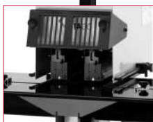
HM6 - showing 2 heads option.