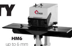
HM6 up to 6 mm

Bench or height-adjustable stand options