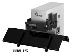
HM 15 up to 15 mm

STAGO = Rugged Germany Quality and Reliability