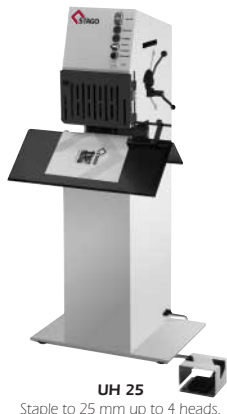
UH 25 Staple to 25 mm up to 4 heads.