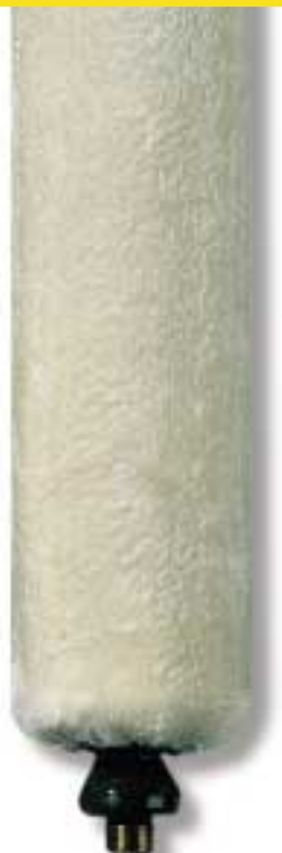
NEW MOL ®