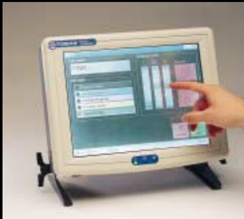
Introducing the Tobias TouchConsole™