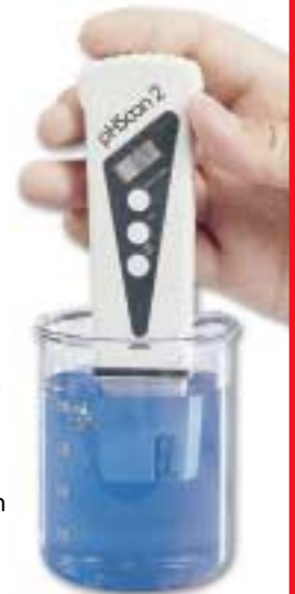
Micro Processor Based

Take the guesswork out of fountain solution control with accurate monitoring that will take no more than 20 seconds a day.