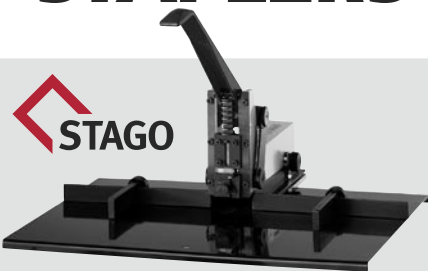
Model H18 Manual stapling machine with one stapling head for flat staples. Will staple from 2 to 180 sheets (=0.2 - 18 mm thick)