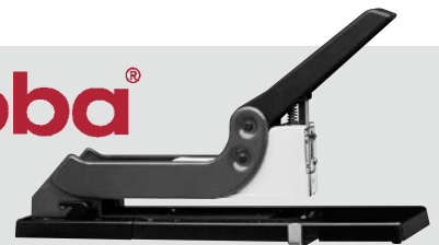
Model 120 Long Max sheet capacity 200 sheets/16 mm. Throat depth: 250 mm.