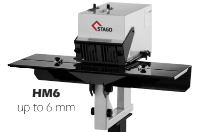
HM 6 up to 6 mm