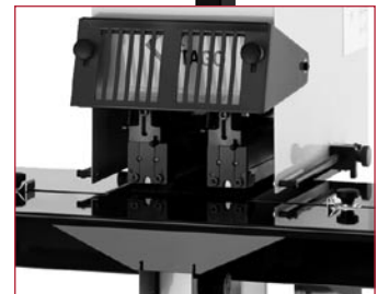
HM 6 - showing 2 heads option.

STAGO = Rugged Germany Quality and Reliability