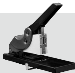
Model 120 Short Max sheet capacity of 200 sheets/16 mm. Throat depth: 100 mm.