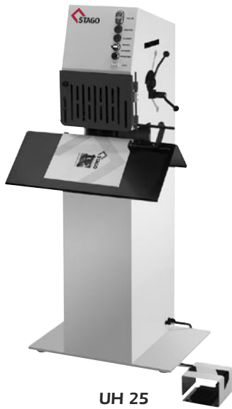
UH 25 Staple to 25 mm up to 4 heads.