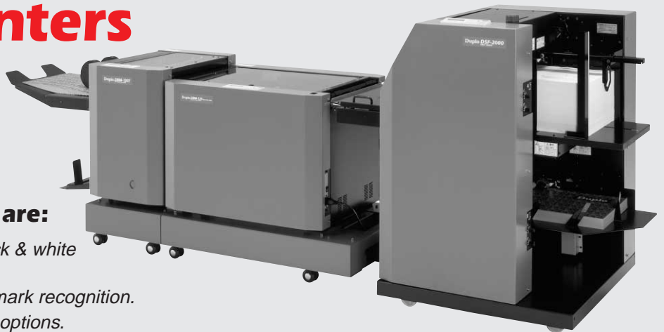
DBM-120T Trimmer DBM-120SxS Bookletmaker DSF-2000 Document Sheet Feeder